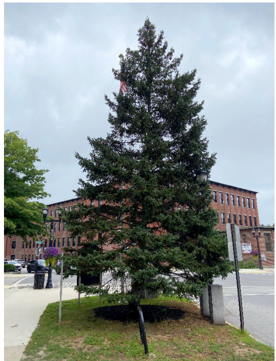
Above: The large spruce tree outside of City Hall is growing crooked and leaning towards Adams Street.

No road closures are anticipated during the tree’s removal.